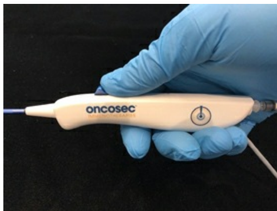
Figure 1b Catheter-based VLA close up of tip